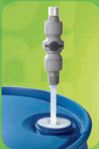
Universal Drum Adaptor Kit (shown with NSH Series)