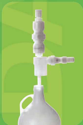
BottleQuik UBA 2-Port Bottle Adaptor Kit (shown with CQG and CQH)