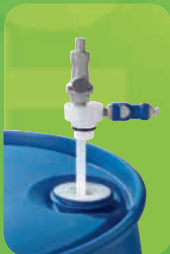
Universal 2-Port Drum Adaptor Kit (shown with HFC12 and NS4)